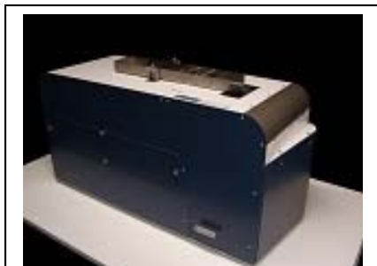
OCCHIO COFFEE-TRAK PARTICLE SIZE AND SHAPE ANALYZER (Directly traceable to NIST)

High resolution digital imaging, however, has the ability, to provide measurement data, that correlates with either method.